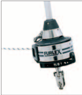
Manual Furlex 200S.

Push-button performance is an easy upgrade for anyone who already has a manual Furlex 200S or 300S series on their yacht. The furling line, drum and line guard assembly are simply replaced with a Furlex Electric motor unit. No sail conversion is required as the luff length of your existing sail is unaffected.