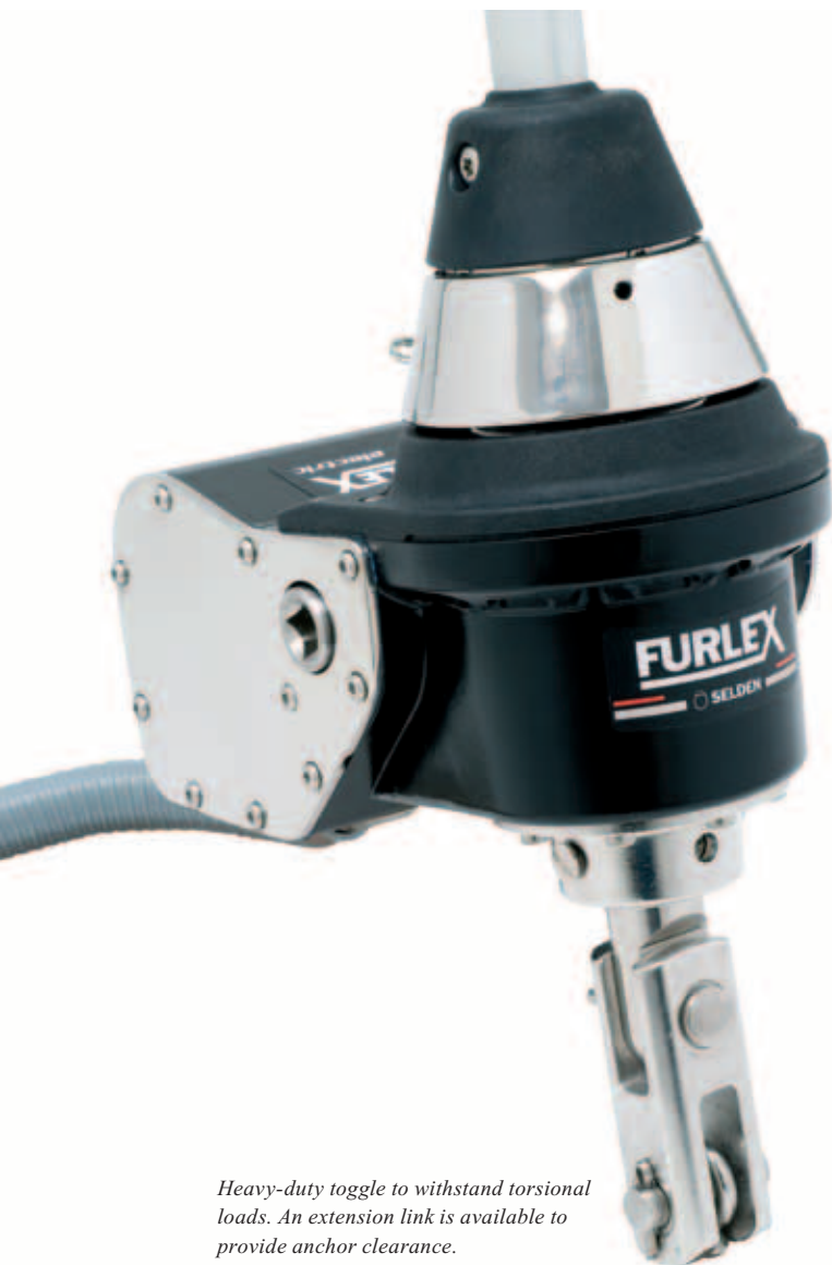
Heavy-duty toggle to withstand torsional loads. An extension link is available to provide anchor clearance.