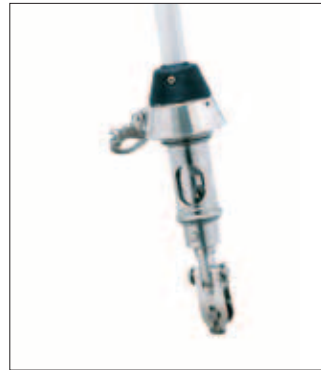
Ready to get powered up.