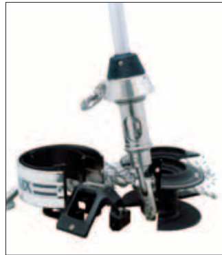
Remove line guard, line guide, rope and drum halves.