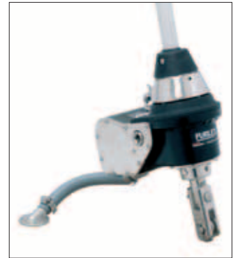
Slide on Furlex 200E from below and install the cables. Done!