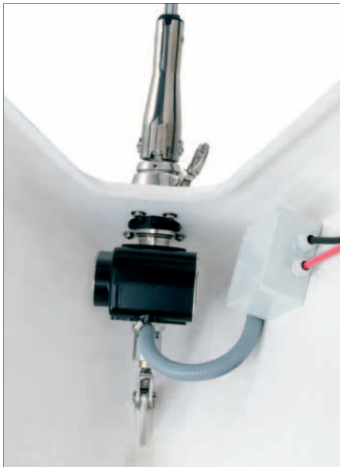
Through-deck installation of a Furlex 200E. The connection box is water-tight.

Furlex Electric is available for either on-deck or through-deck installations. The main advantage of a through-deck installation is better sailing performance as a result of maximised luff length. More space on the foredeck is an added bonus!